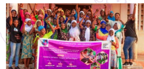
FILLES EN ACTIONS: documenting, informing and raising awareness of period poverty