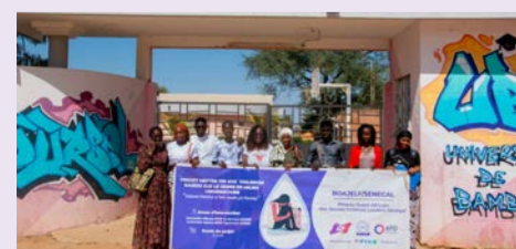
ROAJELF: putting an end to GBV in universities