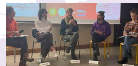
FILATIONS: raising awareness among the next generation of feminists