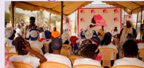
JGEN: The 1 st West and Central African feminist summer school