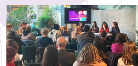
INSTITUT DU GENRE EN GEOPOLITIQUE: turning feminist foreign policy into an advocacy tool