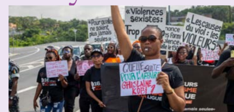
LIGUE IVOIRIENNE DES DROITS DES FEMMES: the legacy of Ivorian women