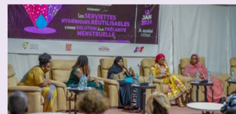
INITIATIVE POUR LA SANTÉ DE LA REPRODUCTION: championing girls' health through art