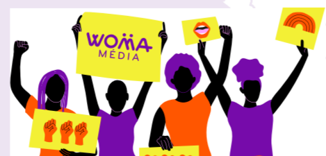
WOMIA Media: Raising the voices of women and LGBTQ people