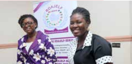
ROAJELF Benin: empowering women for a fair, sustainable world