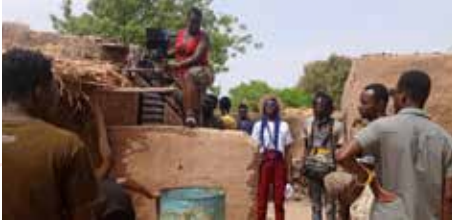
Taafé Vision: rewriting the script for gender equality