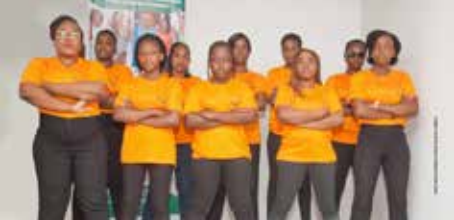
The Young Amazonian Women for Development foundation: empowering women, taking action against violence