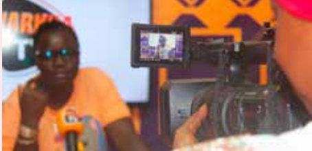
Warkha TV: the first production platform for feminist content in Senegal