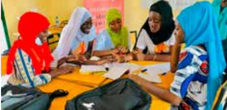
Nigerian Young Women Leaders: combating gender-based violence