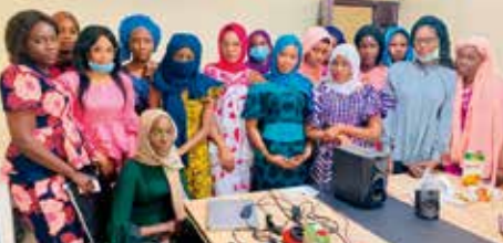
Voix des Femmes: raising voices to empower Mauritanian women