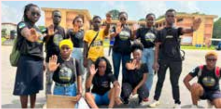
Breaking the silence with Stop au Chat Noir!