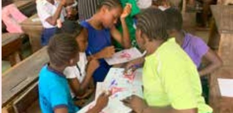
Gouttes Rouges (red drops): united in the fight against period poverty and illiteracy!