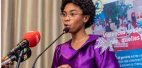
Supporting the girls' revolution: the Guinean Young Women Leaders club